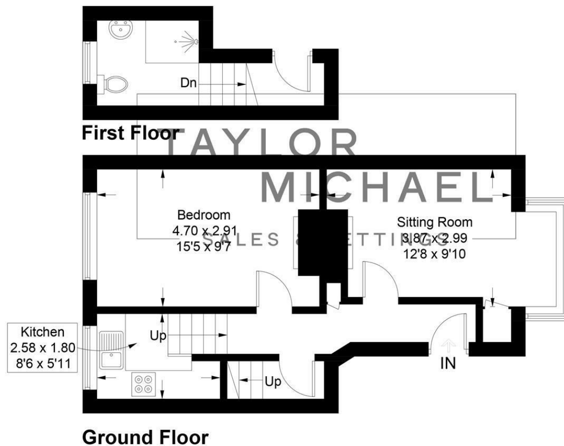
Illustration for identification purposes only, measurements are approximate, not to scale. Imageplansurveys @ 2025